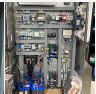
2024 Barrier Control Cabinet with BBU

Protect & Extend Your Investment. Contact Us Today to Modernize Your GRAB barrier.