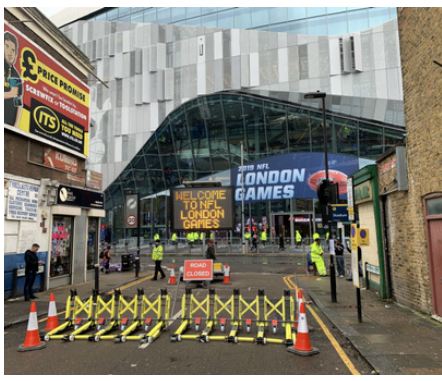
Special Event Security

Specifically designed for Hostile Vehicle Mitigation and Perimeter Security, the MVB-3X is used for Special Events within a city, county, or venue and serves as a secondary line of defense for access control points. The system was created for urban areas, the protection of critical infrastructure and special events, law enforcement and military units worldwide.