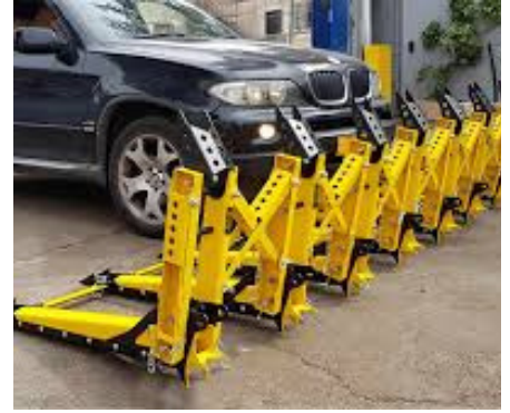
High Impact Capabilities