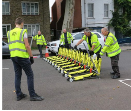
Easy and Quick Assembly